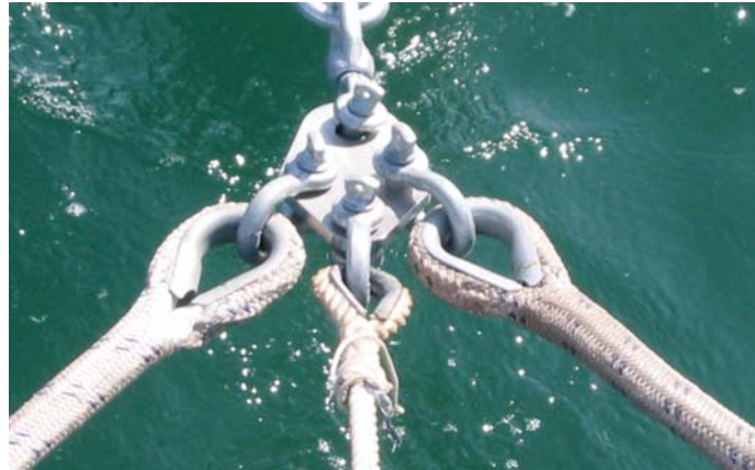
Diagram A - Multihull system shown.